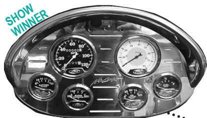
Shown with Motorsport gauges, Tach is white only for picture