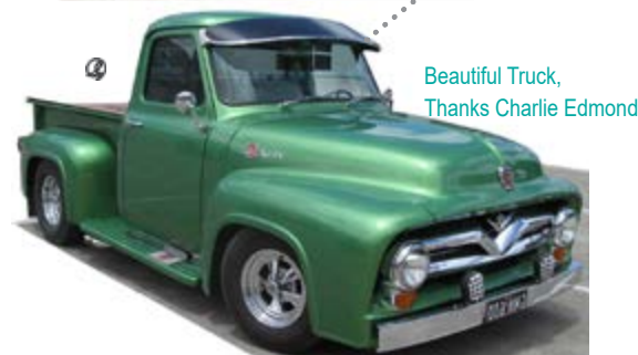
Beautiful Truck, Thanks Charlie Edmond