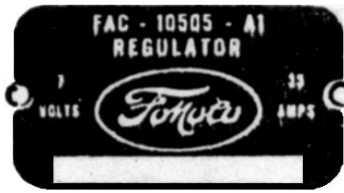
VOLTAGE REGULATOR METAL TAG (FAC-A1)

1953 . . . . . D-104 . . . . . $5.90 ea.