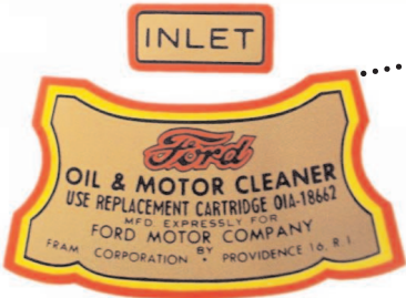
AIR CLEANER SERVICE INSTRUCTIONS

1953 (2 pcs) . . . D-064 . . . . . $4.50 set. RED ON GOLD BACKGROUND