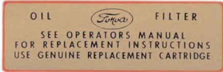
OIL FILTER DECAL SET

1953 all 3 pcs .D-375 . . . . . $10.50 set. FORD STRATO STAR is Clear with Yellow Lettering,