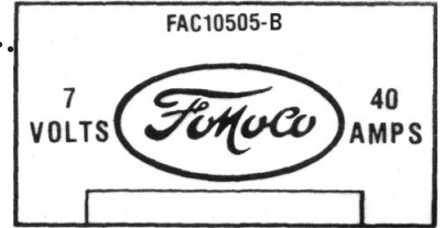
VOLTAGE REGULATOR DECAL (FAP)

1955 . . . . . D-084 . . . . . $3.90 ea. SILVER ON CLEAR