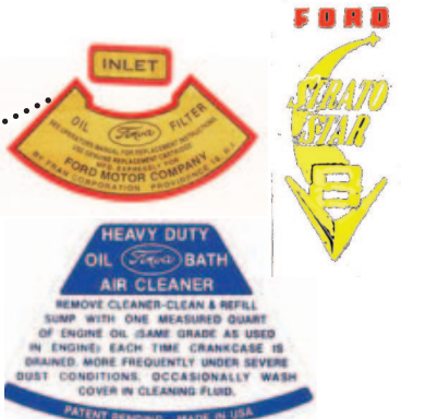
OIL FILTER DECAL SET 6 CYL

1954-56 . . . D-082 . . . . . $6.90 ea. SILVER ON BACKGROUND