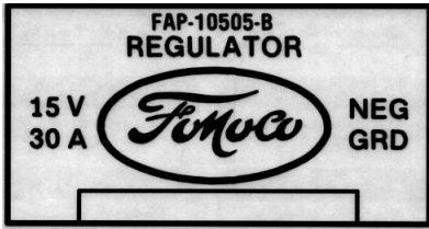
VOLTAGE REGULATOR DECAL (B5AF)

1953-54 . . . . . D-109 . . . . . $4.75 ea. SILVER ON CLEAR