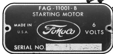
STARTER MOTOR DECAL

1953-55 . . . . . D-103 . . . . . $5.90 ea.