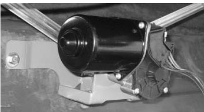
bracket shown grey so you can see it, comes black.