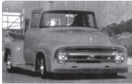
With sway bars