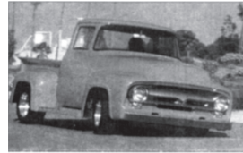
Without sway bars