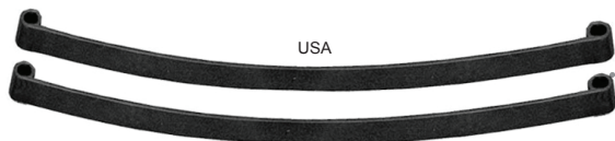
PICTURE NOT OF ACTUAL PART ACTUAL PART IS SIMILAR

Remember the measurements are from original stock height. Most springs are oversize shipping.