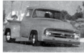
Without sway bars