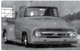
With sway bars