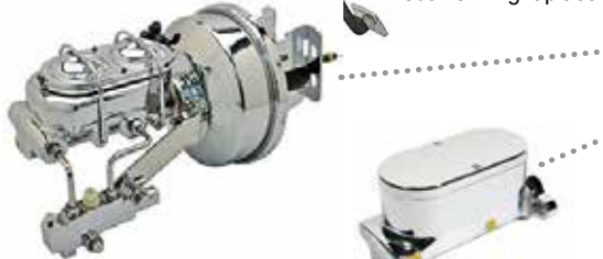
Shown with all chrome part may not have exactly same prop valve etc.