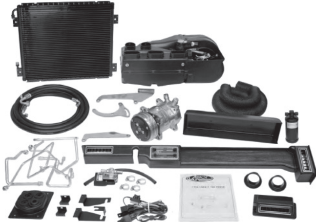
Complete inside and under hood kits shown above