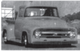
With sway bars