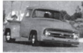
Without sway bars