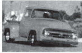
Without sway bars