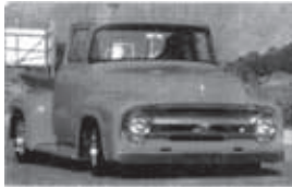
With sway bars