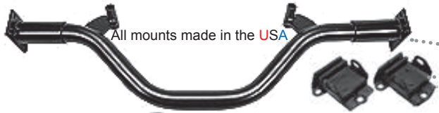
All mounts made in the USA