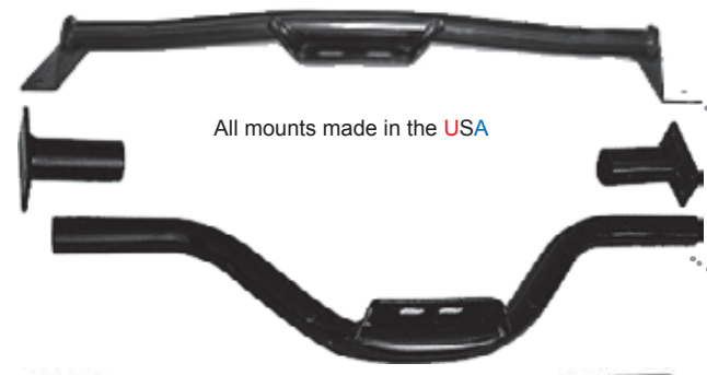
All mounts made in the USA

These mounts do not work with 390 engine pads