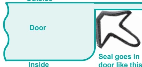
Seal goes in door like this