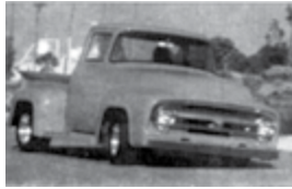
Without sway bars