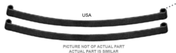
PICTURE NOT OF ACTUAL PART ACTUAL PART IS SIMILAR

Remember the measurements are from original stock height. Most springs are oversize shipping.